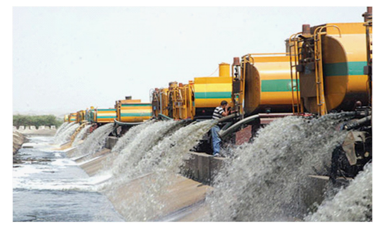
Fig. 1. Turks disposing waste water in the lake

50% lower than those irrigated with PW) (Tab 5). This lower firmness could be attributed to the fungal infection with alternaria that appeared in the central axis of the orange in the form of rot and works its way outward with hardly any external symptoms (Fig. 3 D). SSC and diameter of fruits irrigated with WW were increased by 17 and 34%, respectively, while pH showed insignificant increase (0.15 point) (Table 5). The reduction in pH is very comparable to the reduction reported in Jordan by Shahalam et al. (1998), as they reported a 0.2 unit in the case of freshwater irrigation. It indicated a tendency of the wastewater to lower the soil pH slightly.