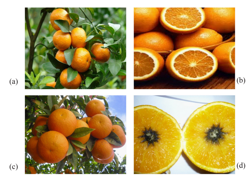
Fig. 3. Orange fruits collected from a controlled area irrigated with potable water (a) with health fruits (b). Fruits from a contaminated site irrigated with wastewater (c) have unhealthy fruits, showing rotting starting in the central axis of the orange and works its way outward (d)

can induce potential risks to human health through accumulation and persistence in soil, (e.g. Yan et al. , 2008). The bad and unpleasant odor of WW and soils indicate presence of different types of pathogens which could further become potential source of entry into human through food chain, people who consume the crops, causing health problems to farm workers, and in the people who inhale aerosols generated from the applications of the wastewater (Chary et al. , 2006; Zhao et al. , 2014).